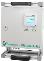
Carrying handle and stand